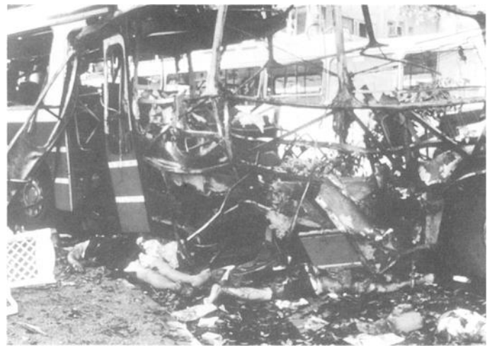
FIG. 1—Scene of a suicidal bombing inside a crowded bus.