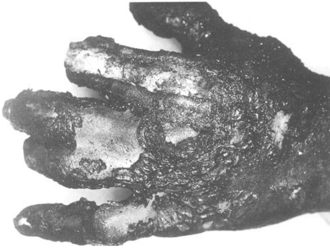
FIG. 3—Individualizing characteristics such as partial syndactilia of a burnt hand used for positive identification.