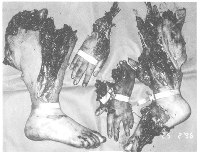
FIG. 2—Severe fragmentation of a suicidal bomber. Body parts are re-associated by means of genetic markers.

by flying debris (10.4%) and blast injuries (2.3%) (3). The standard operating procedure involved in the identification of victims of suicidal bombings and the main caveats encountered during the investigation are discussed below.